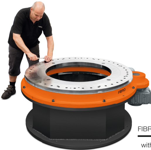
FIBROMAT® AT.1250 with machine stand

Extremely short emergency stopping times and a higher torque are achieved using two drives that have been clamped without play. On top of that, positioning accuracies up to \pm 10 arc seconds can be achieved using a direct measuring system.